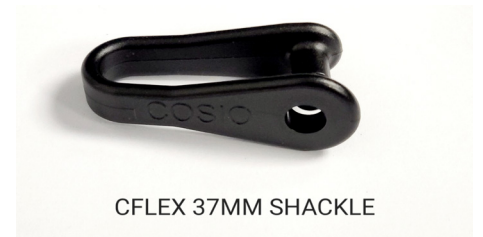
CFLEX 37MM SHACKLE